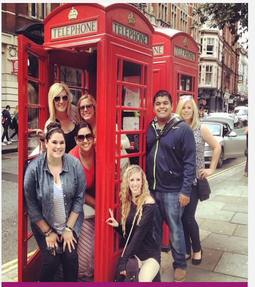
London phone booth.

The UK has seen 15% of our summer alumni, specifically England and Scotland. London is a very popular destination amongst theatre and communications majors, although, students across multiple disciplines including accounting and English have studied in London too. Meanwhile, Stirling and Edinburgh Scotland have hosted athletic training and nursing majors.