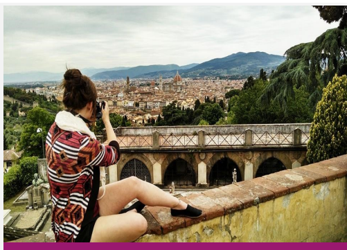
Photography in Italy.

30% of summer study abroad alumni have studied in Spain. Most of the buffs that have traveled to