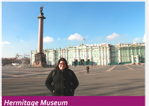
Hermitage Museum

I remember stepping into the Office of Study Abroad in the Spring of 2013 with the decision that I was going to go abroad. I didn't know where, but I knew I was going to go somewhere and it was going to be exciting. I often joke that I decided to travel to Ukraine by closing my eyes and pointing at the country on a large-scale map; however, it's not true. I had hardly ever heard of Ukraine at that point in my life, only hearing it in passing when mentioned in TV shows or movies.