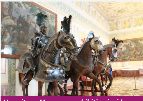
Hermitage Museum—exhibition inside

All the knowledge I had accumulated over the years on the